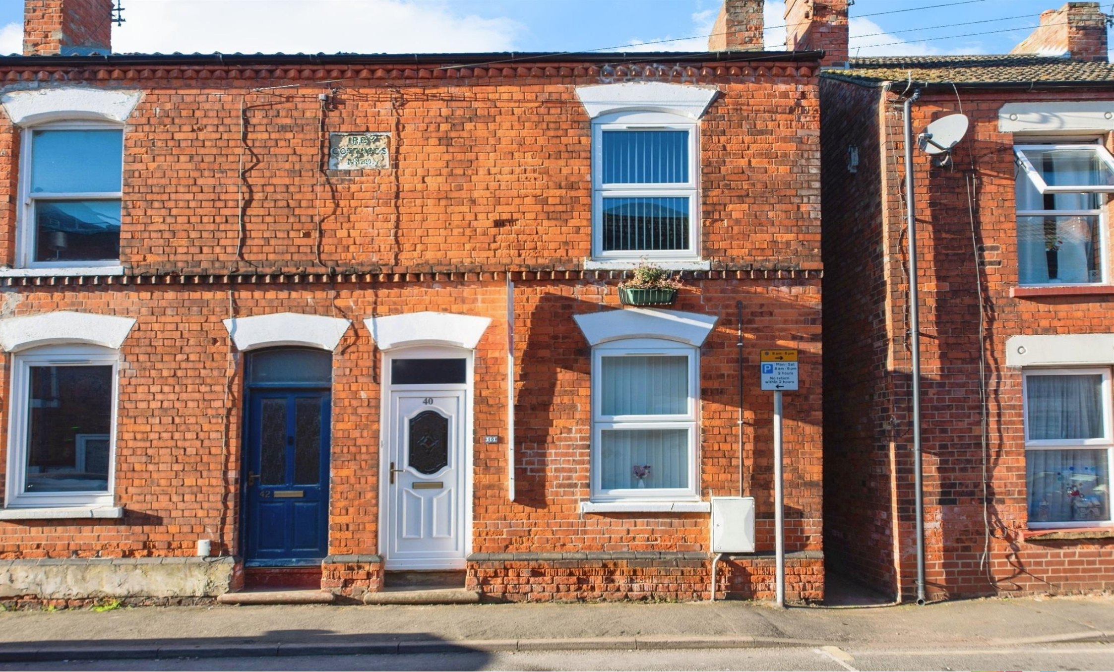
Tower Street, Boston PE21 8RX