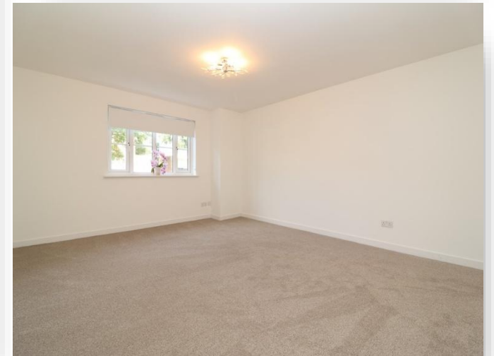
Glenmore Place, Glasgow G42 0EA