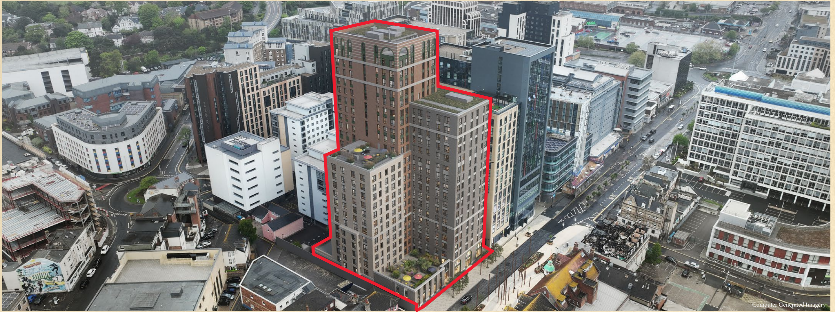
Computer Generated Imagery