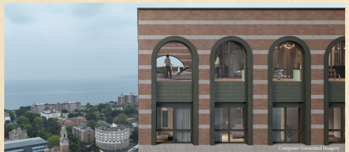
Computer Generated Imagery