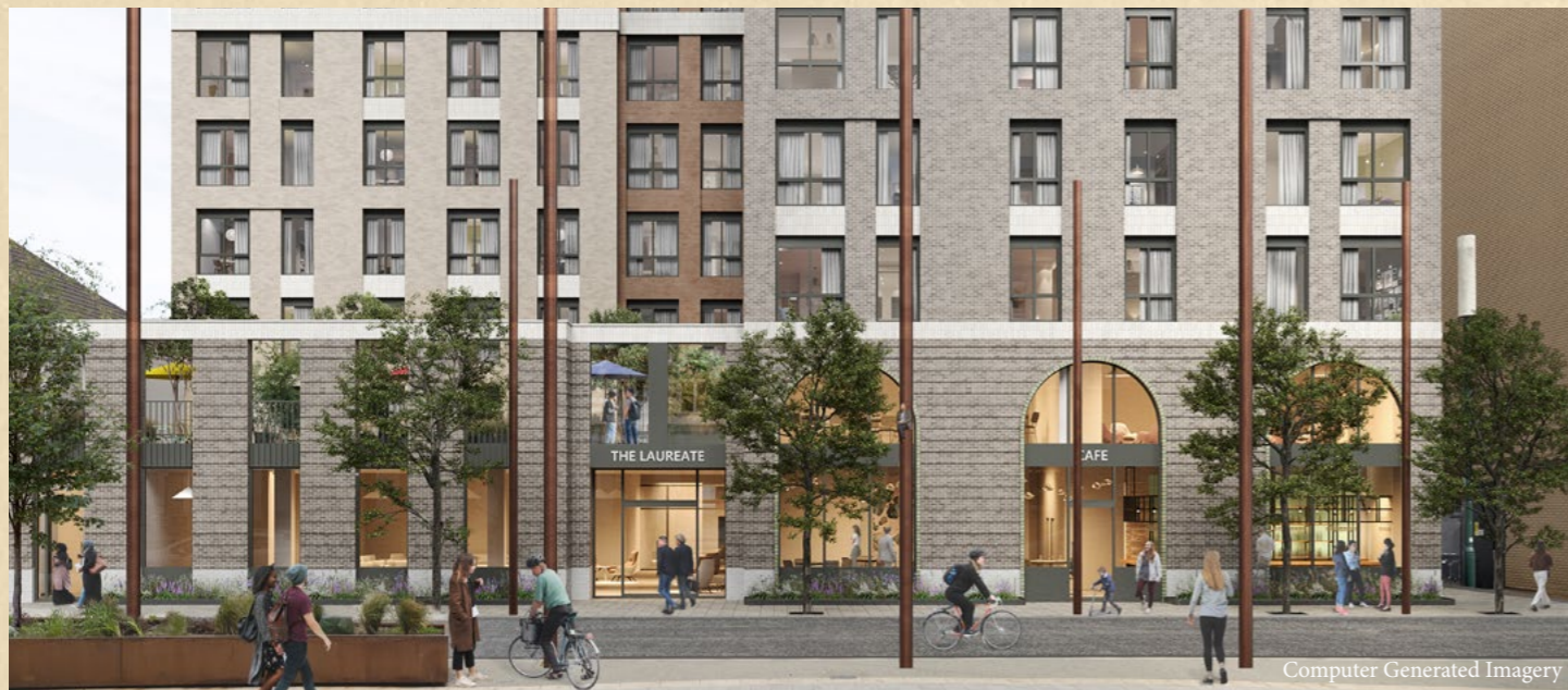
Computer Generated Imagery