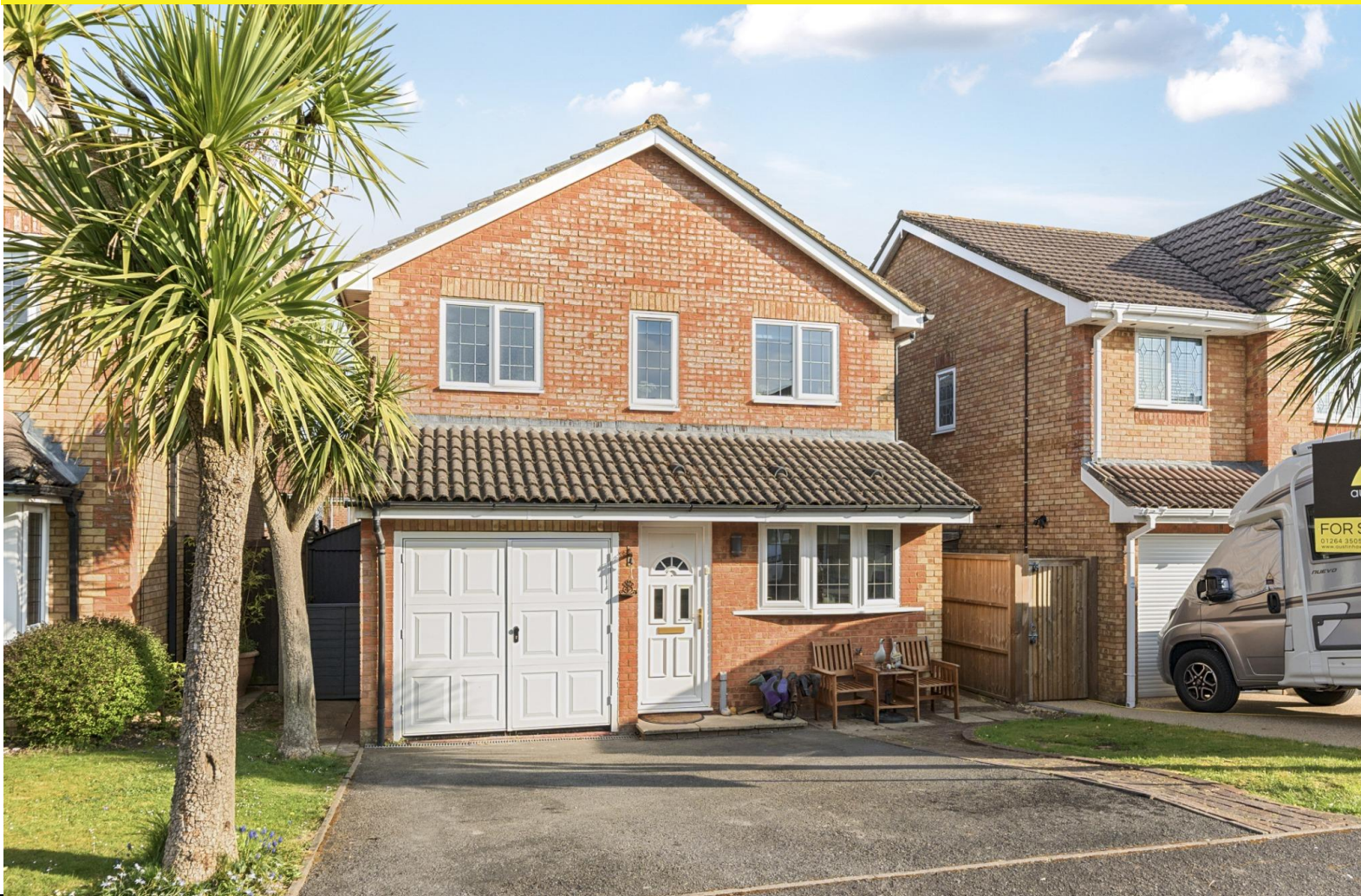
Pearman Drive, Andover