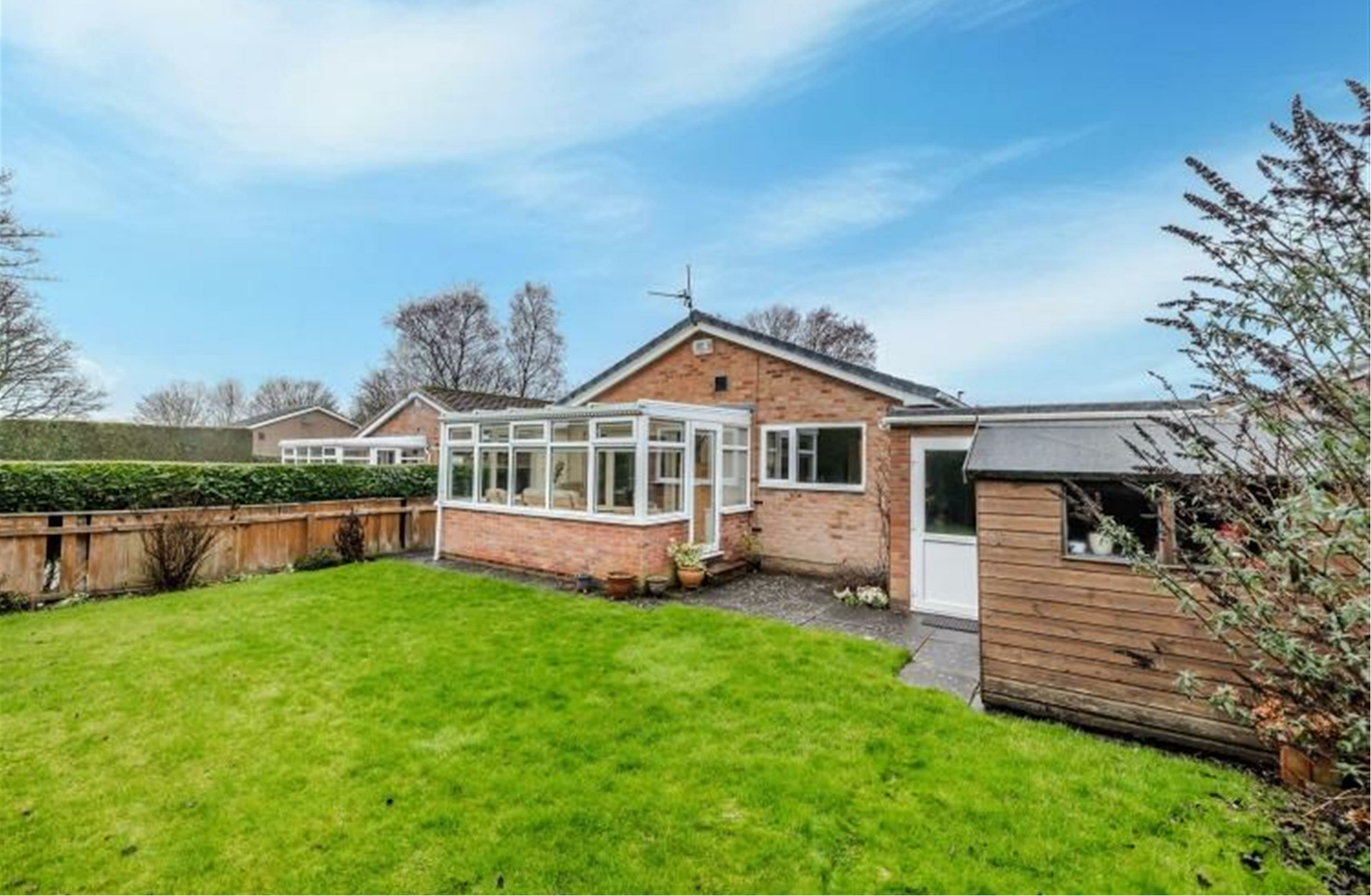
23 Mangrove Close, St Johns Estate, Newcastle upon Tyne, NE5 1YA