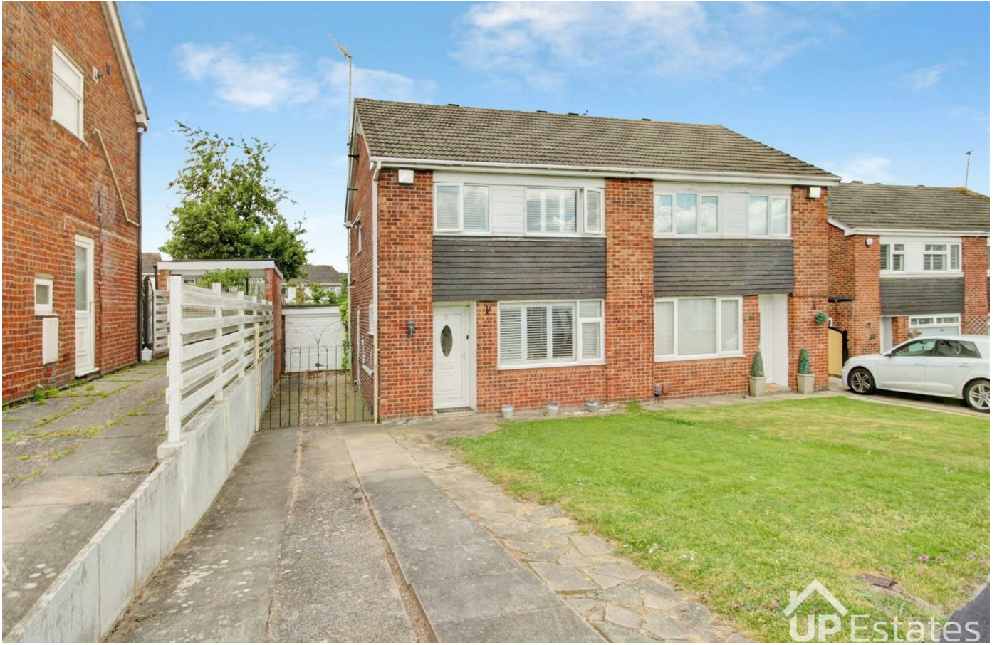
Wimborne Drive, Coventry