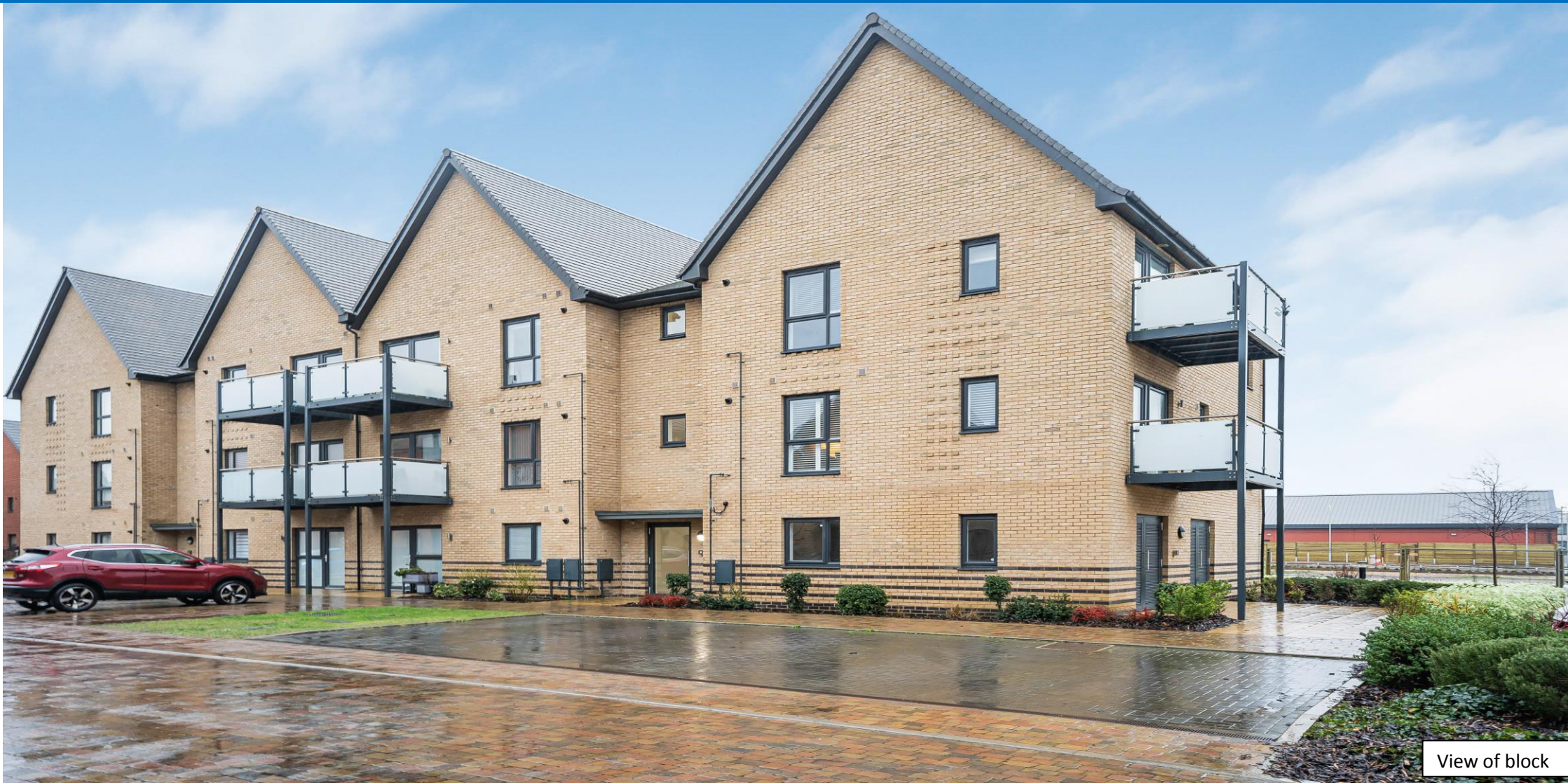
View of block