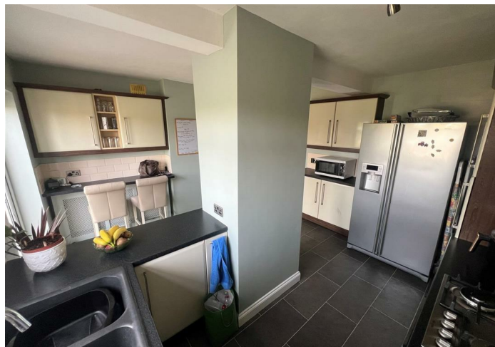
Fitted Breakfast Kitchen