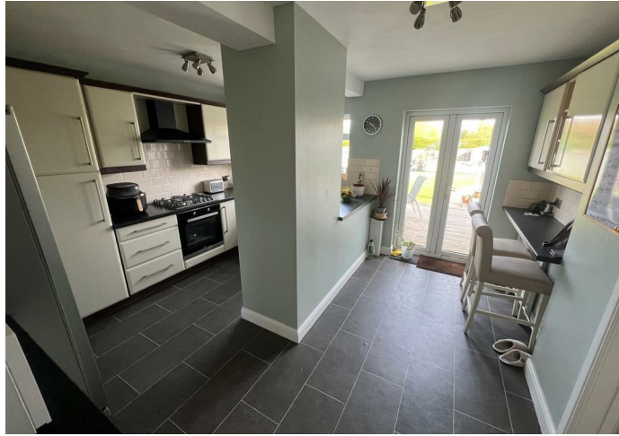
Fitted Breakfast Kitchen