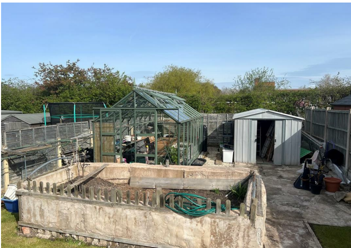
"Rhino" Greenhouse and Useful Shed