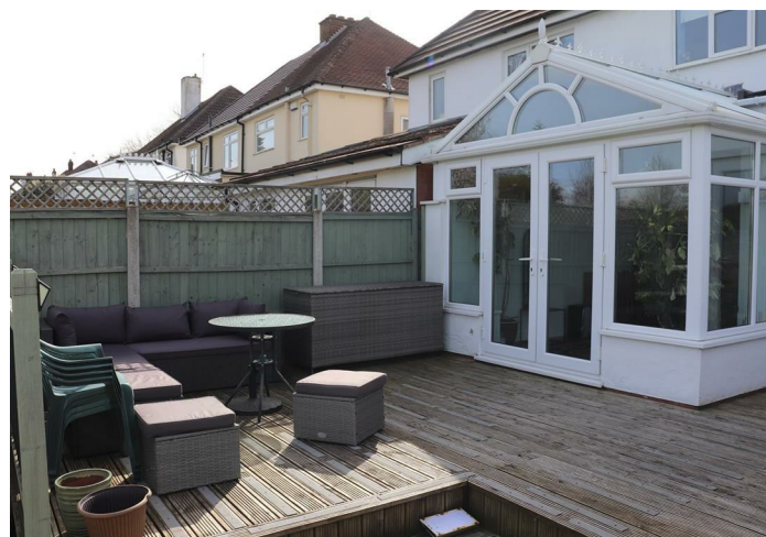
Raised Decking Area