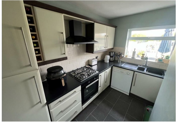
Fitted Breakfast Kitchen