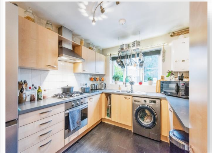
Fir Tree Court, Mildenhall IP28 7SL