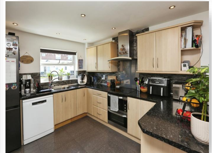
Hereford Court, Gosport, PO13 8DH