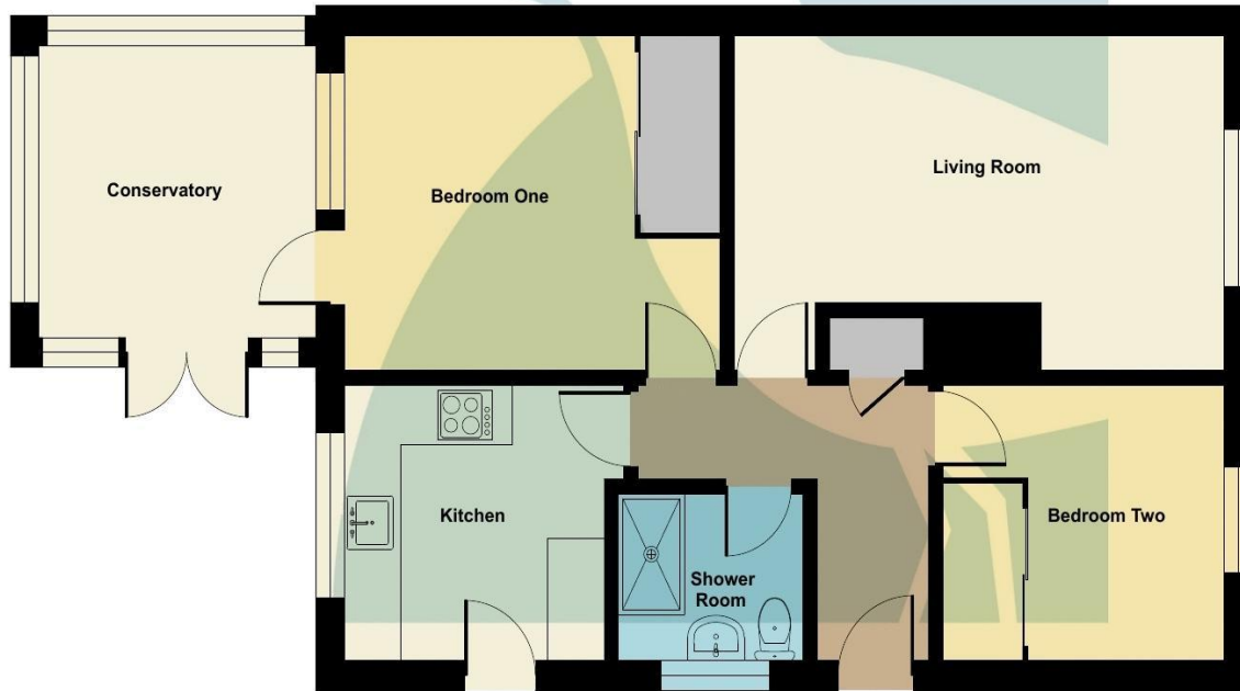
GROUND FLOOR Approx. 733 SQFT (INTERNAL)