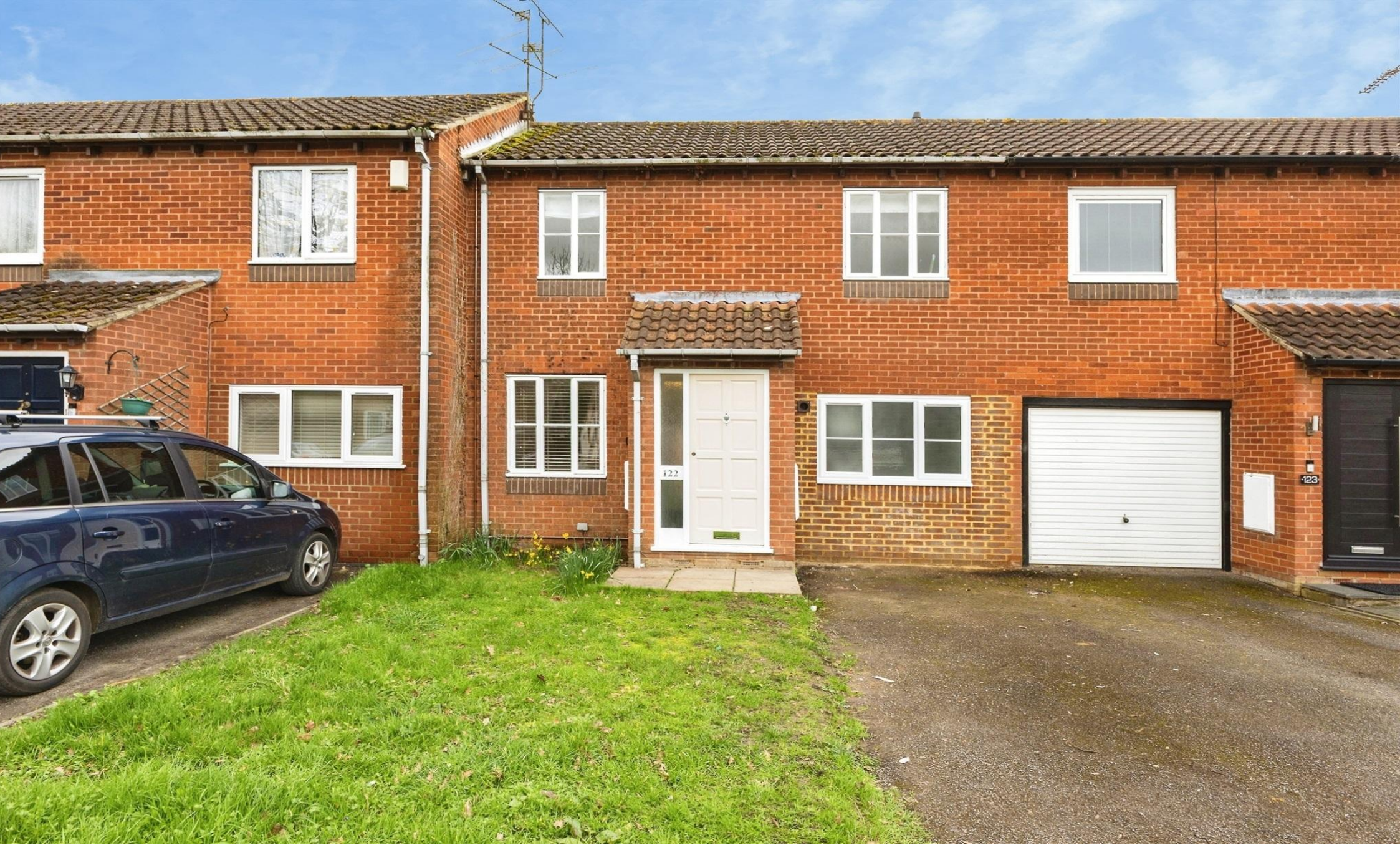
Chilcombe Way, Lower Earley Reading RG6 3DD