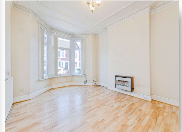
Cosmeston Street, Cathays Cardiff CF24 4LQ