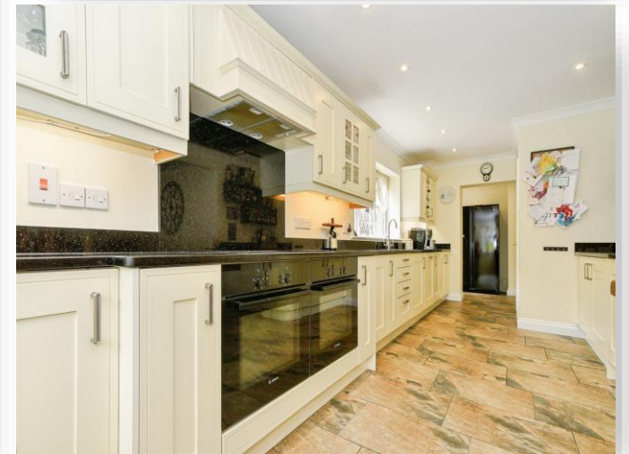
Chardan, High Street, Netheravon Salisbury SP4 9RT