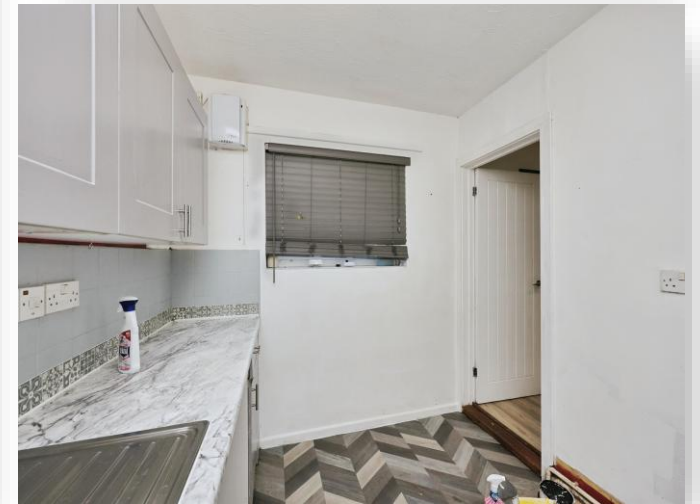
William Mear Gardens, Norwich, NR1 4PE