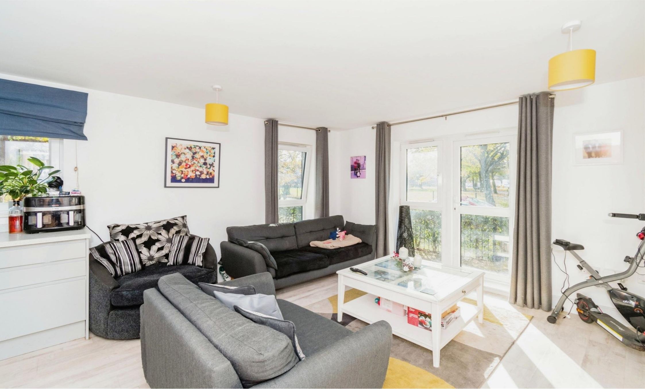
Hamilton House, Meridian Way, Southampton SO14 0FP