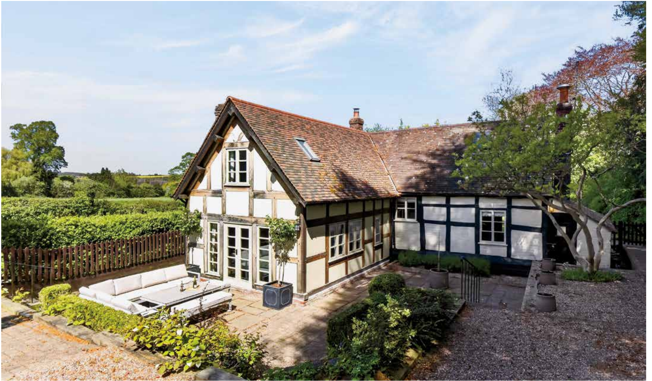
Shore Cottage Shore Lane | Cressage | Shropshire | SY5 6BS