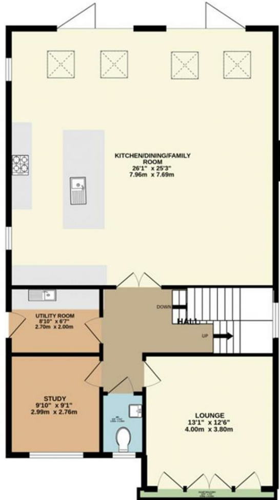
RAISED GROUND FLOOR 1129 sq.ft. (104.9 sq.m.) approx.