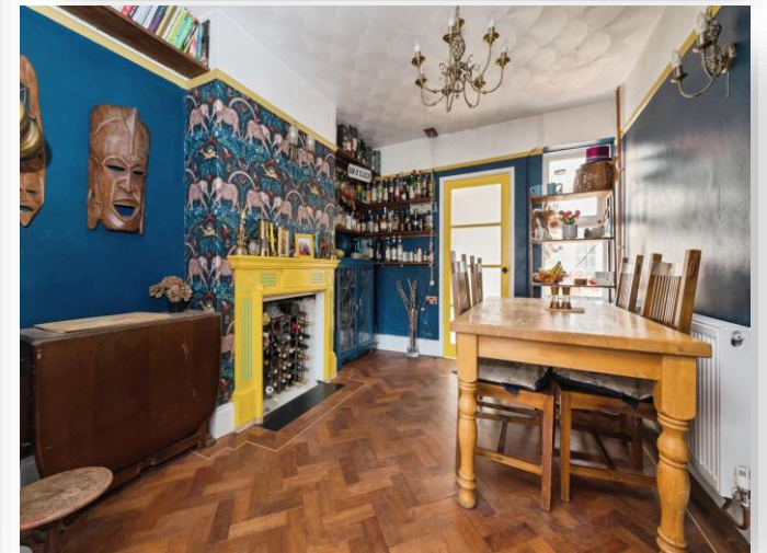
Glen Road, Southampton SO19 9EH