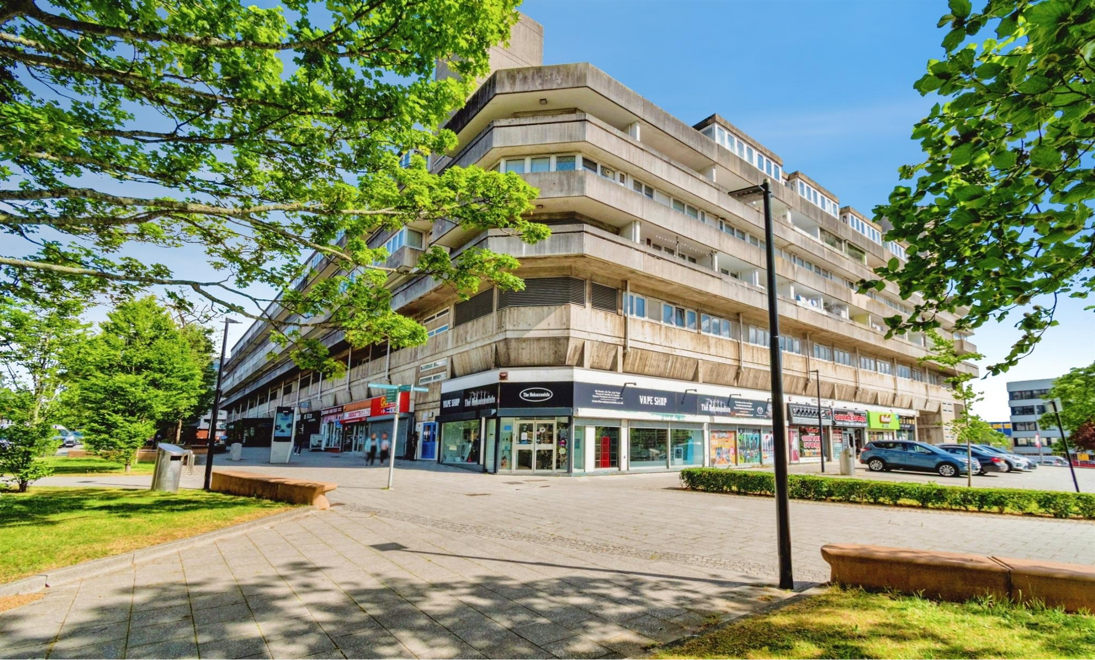
Wyndham Court, Commercial Road, Southampton SO15 1GU