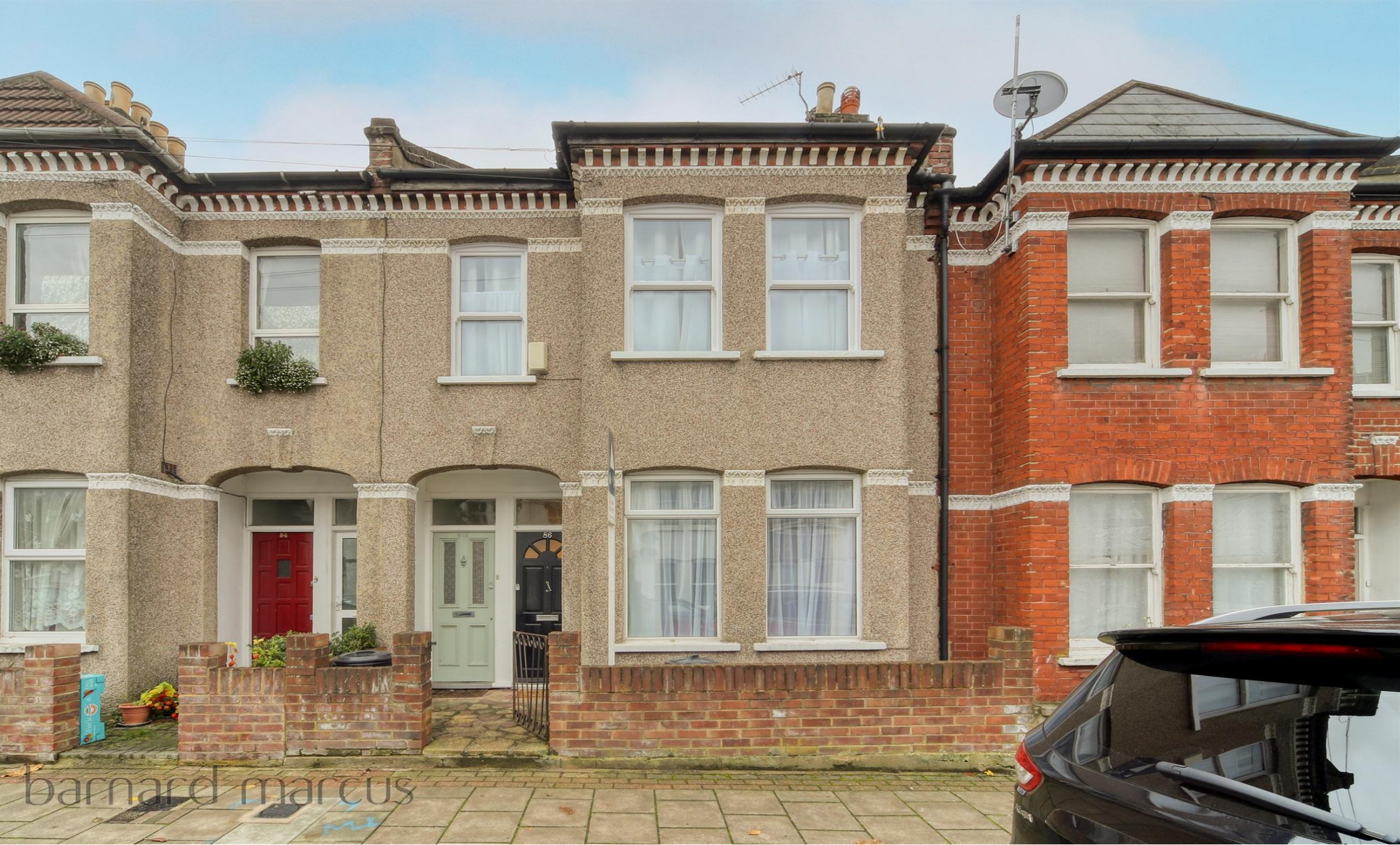
Leveson Street, London SW16 6DE