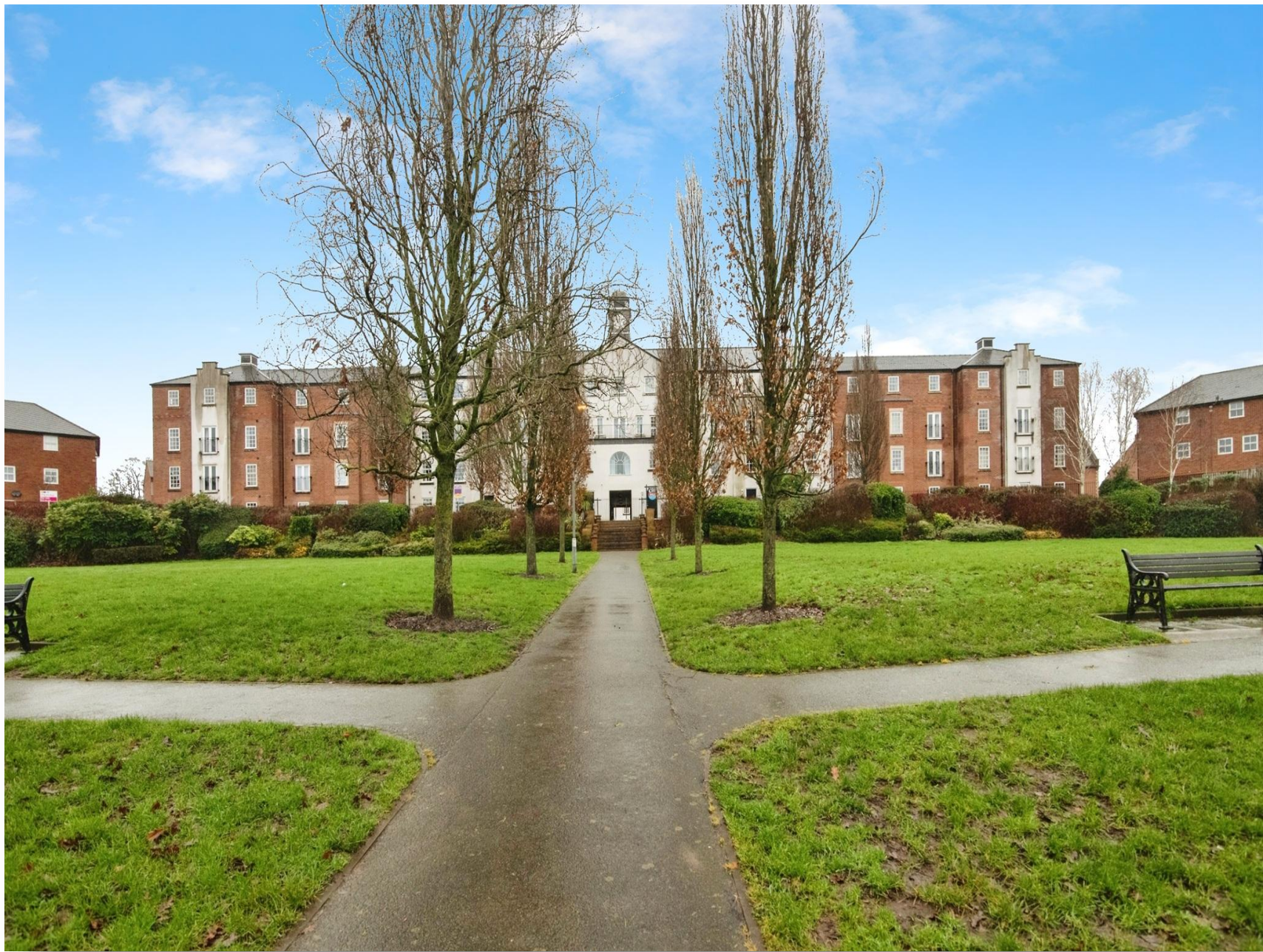
Horseshoe Crescent, Great Barr Birmingham B43 7BL