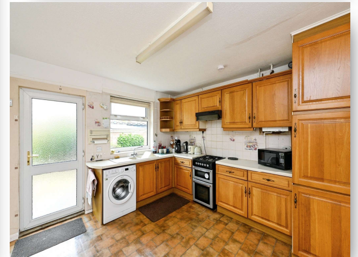
Crow Hall Estate, Downham Market, PE38 0DG