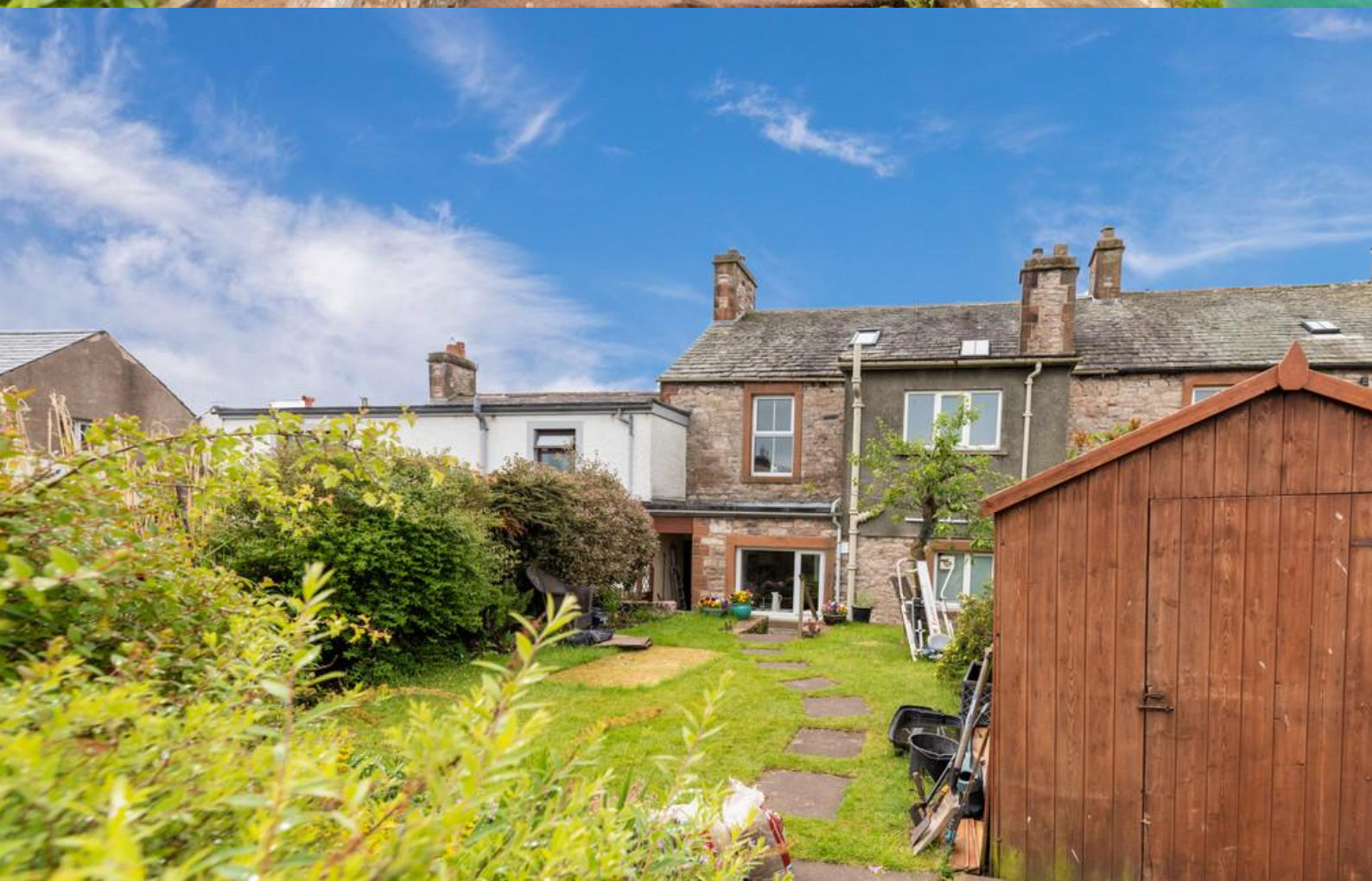
Rear Aspect and Garden