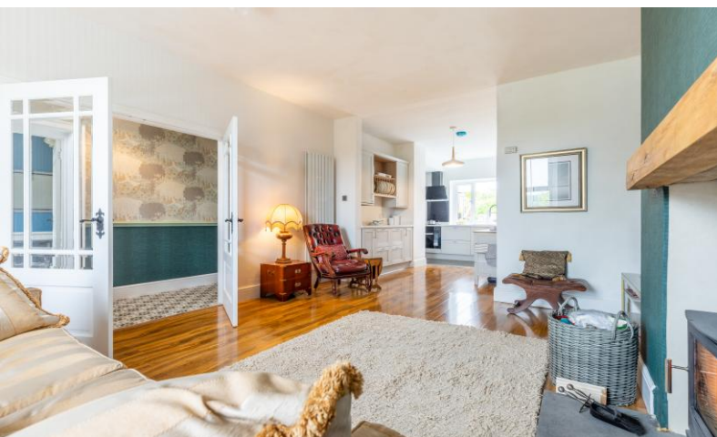
Living/ Dining Room