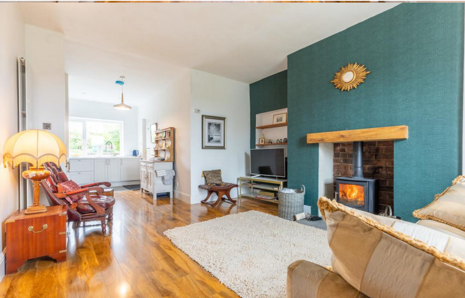
Living/ Dining Room