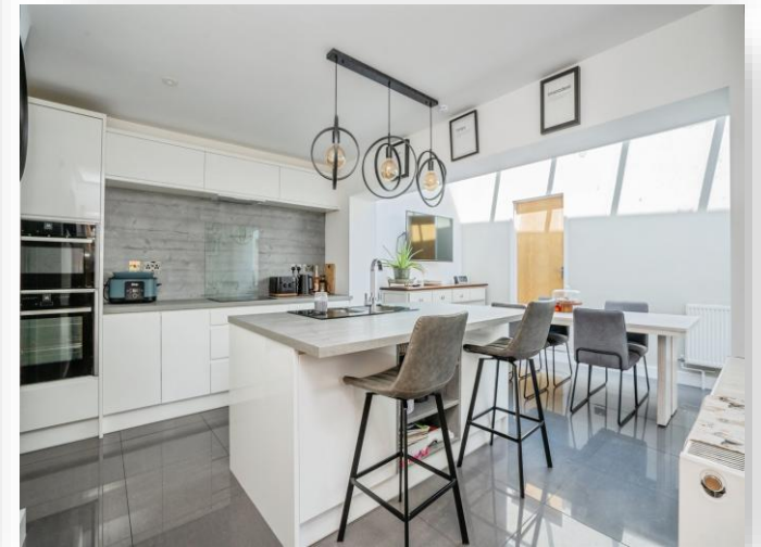
Roman Way, Havant PO9 3PR