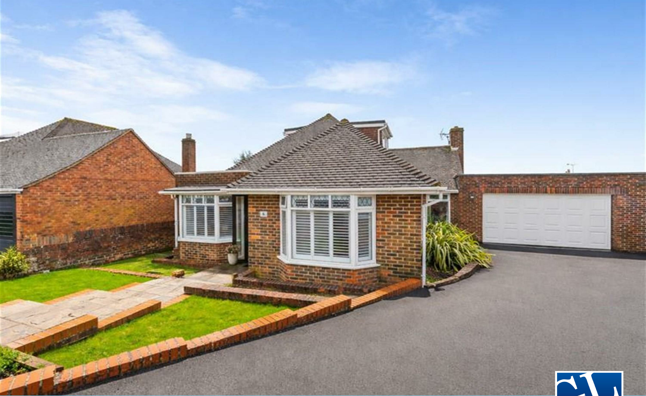
6, Maple Close, Worthing, West Sussex BN13 3DR