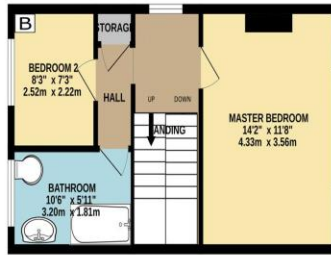
1ST FLOOR 394 sq.ft. (36.6 sq.m.) approx.