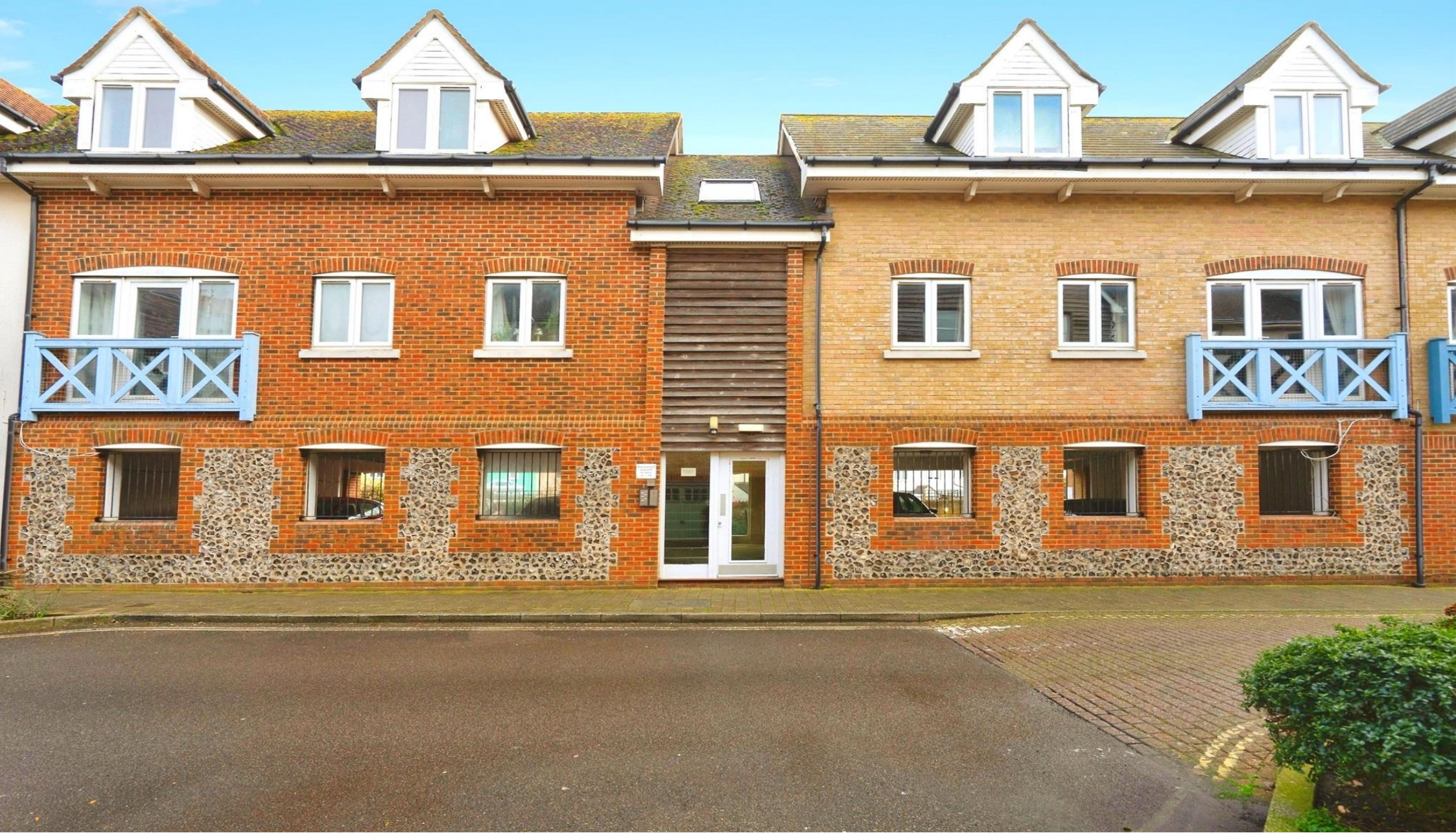
Weavers Court Ropetackle, Shoreham-By-Sea BN43 5ES