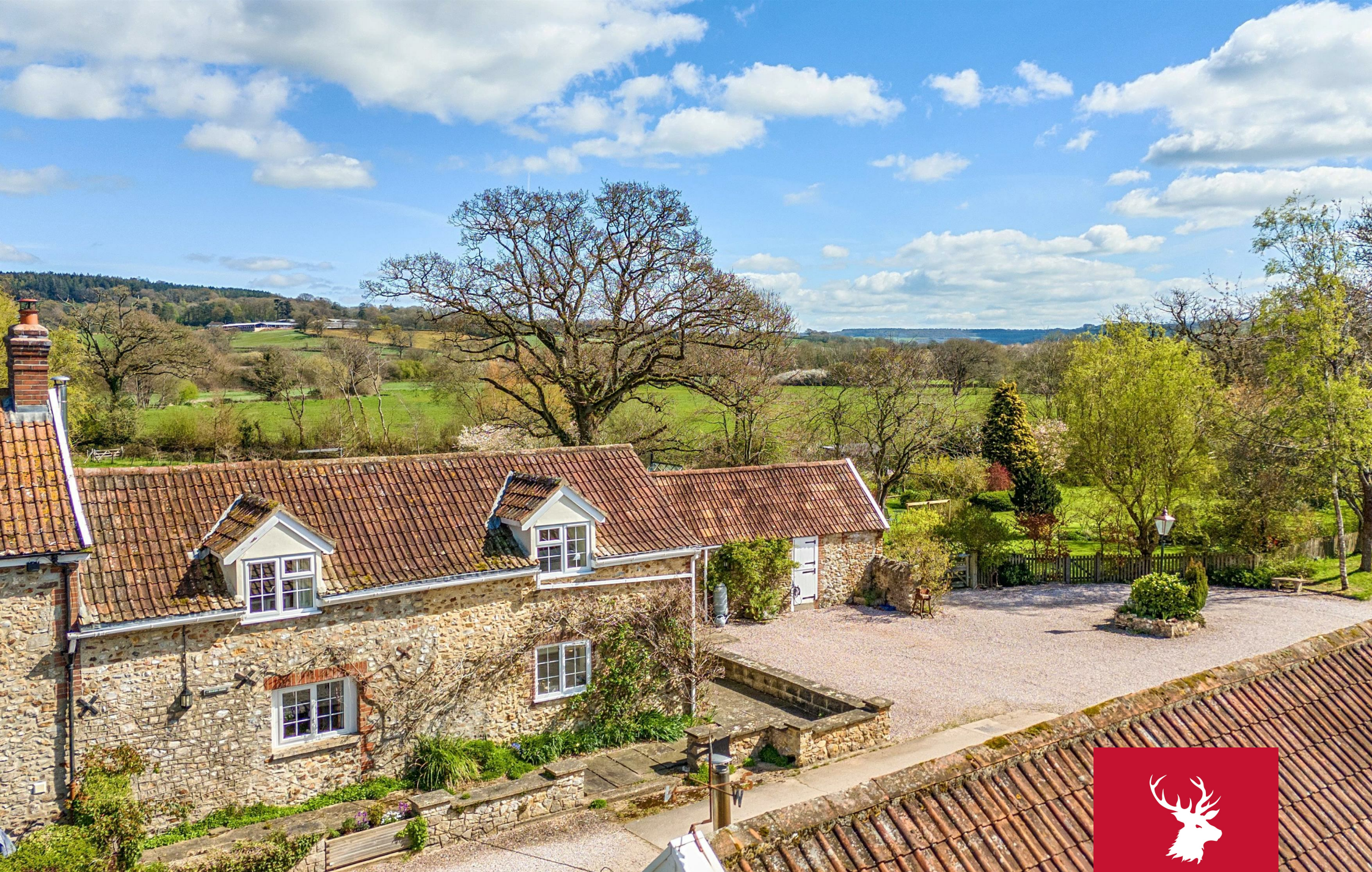
Shute Marsh Farm