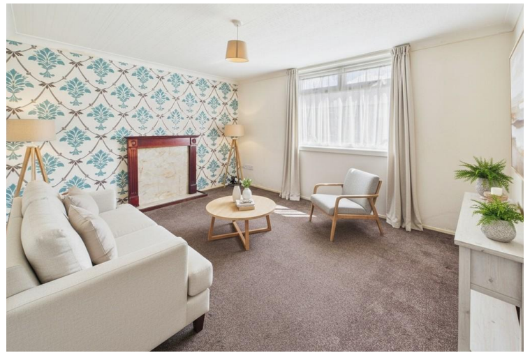
Virtually Staged Lounge