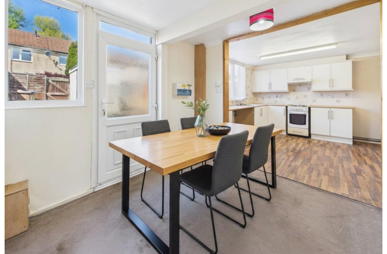
Virtually Staged Dining Room