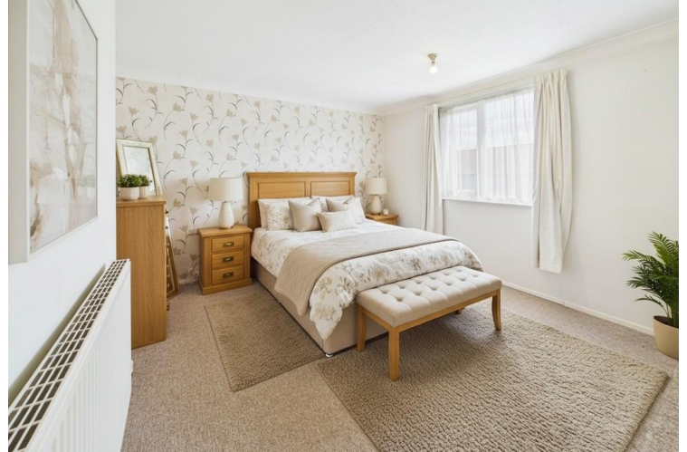
Virtually Staged Bedroom 1