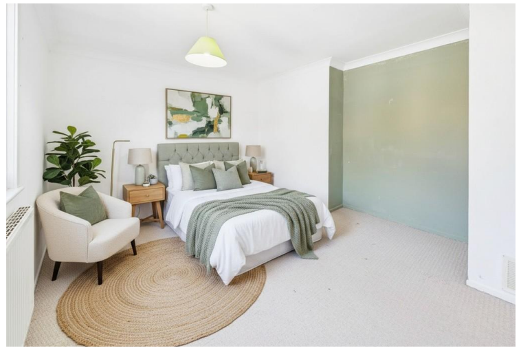
Virtually Staged Bedroom 2