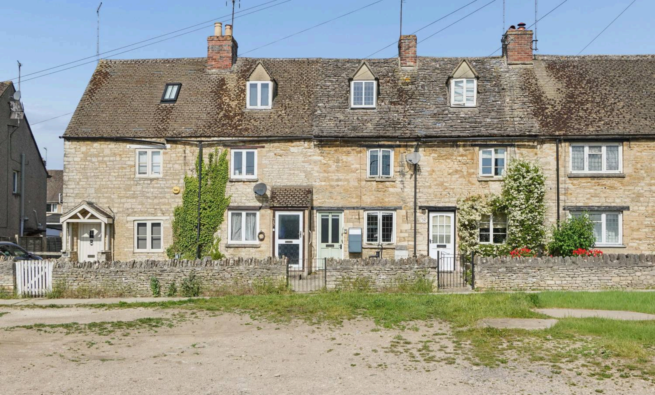
77 Hailey Road, Witney