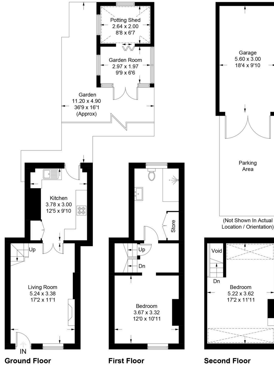
Illustration for identification purposes only, measurements are approximate, not to scale. Fourlabs.co © (ID1305653)