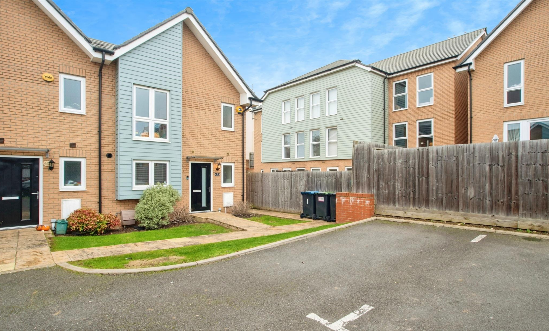
Bridgeview Close, Hemel Hempstead HP3 9AD