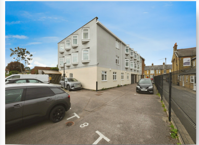
Borne House Turners Hill, Cheshunt Waltham Cross EN8 9EA