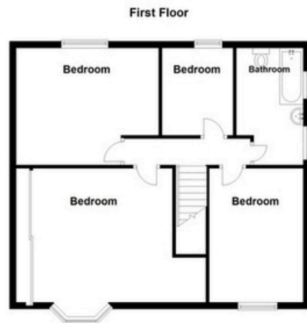
Total area: approx. 192.9 sq. metres (2076.8 sq. feet)