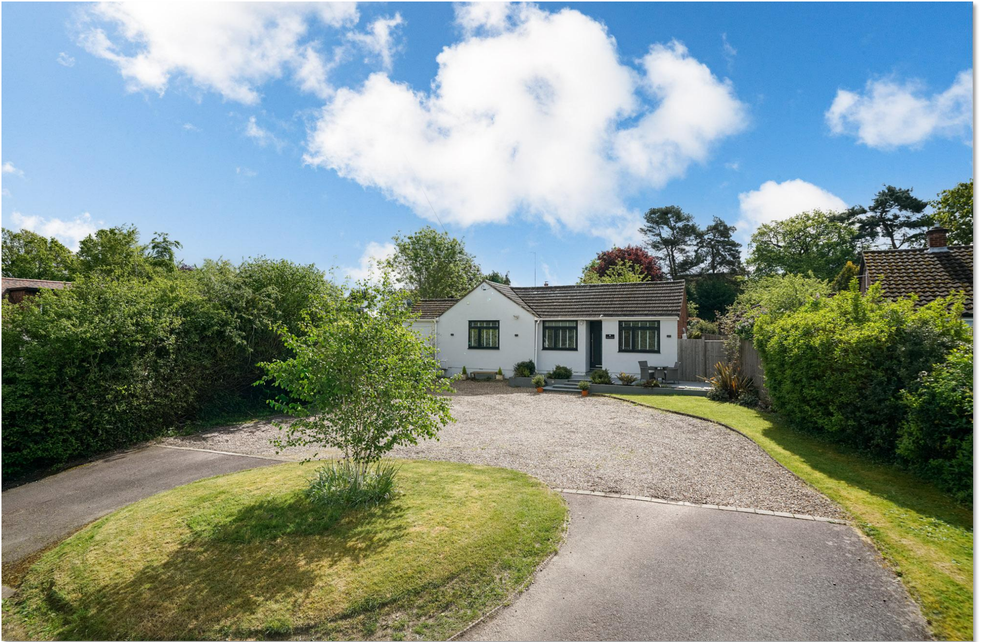
Little Orchard Pea Lane, Northchurch Berkhamsted HP4 3SX