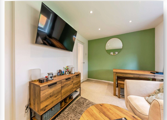
Thorold Avenue, Cranwell Village Sleaford NG34 8DR