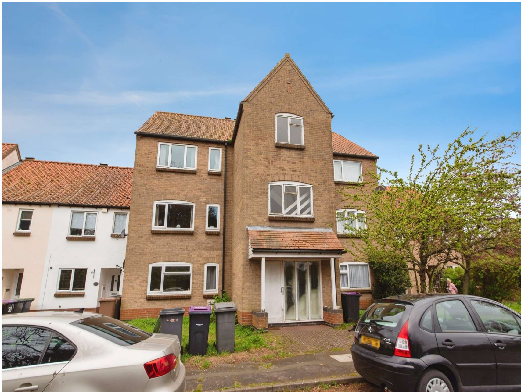
Orchard Close, Sleaford NG34 7GS