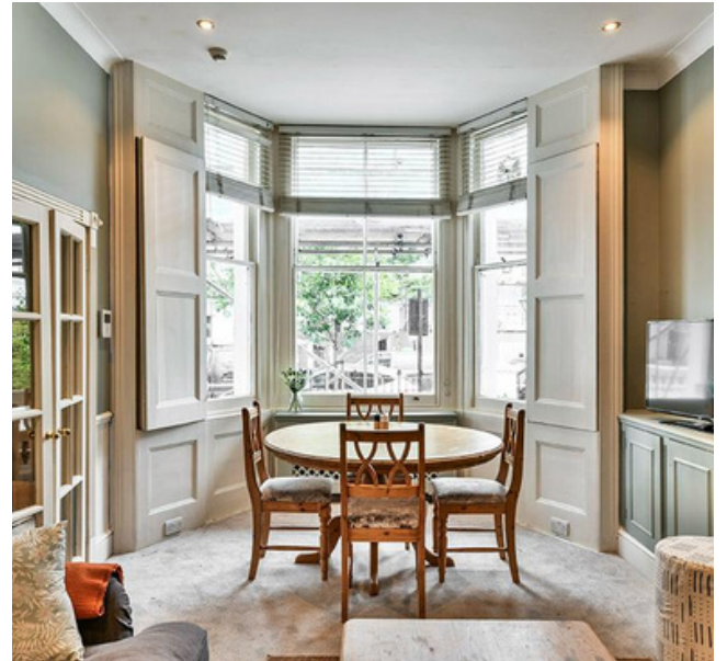
6 Berkeley Gardens, Kensington, W8 4AP