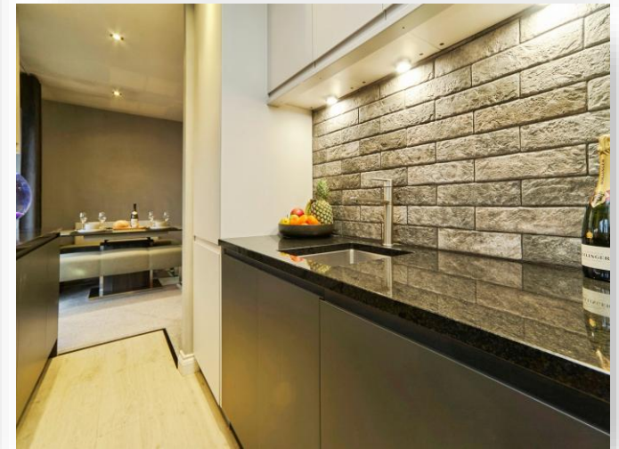
Whernside Court Jackson Walk, Menston Ilkley LS29 6FB