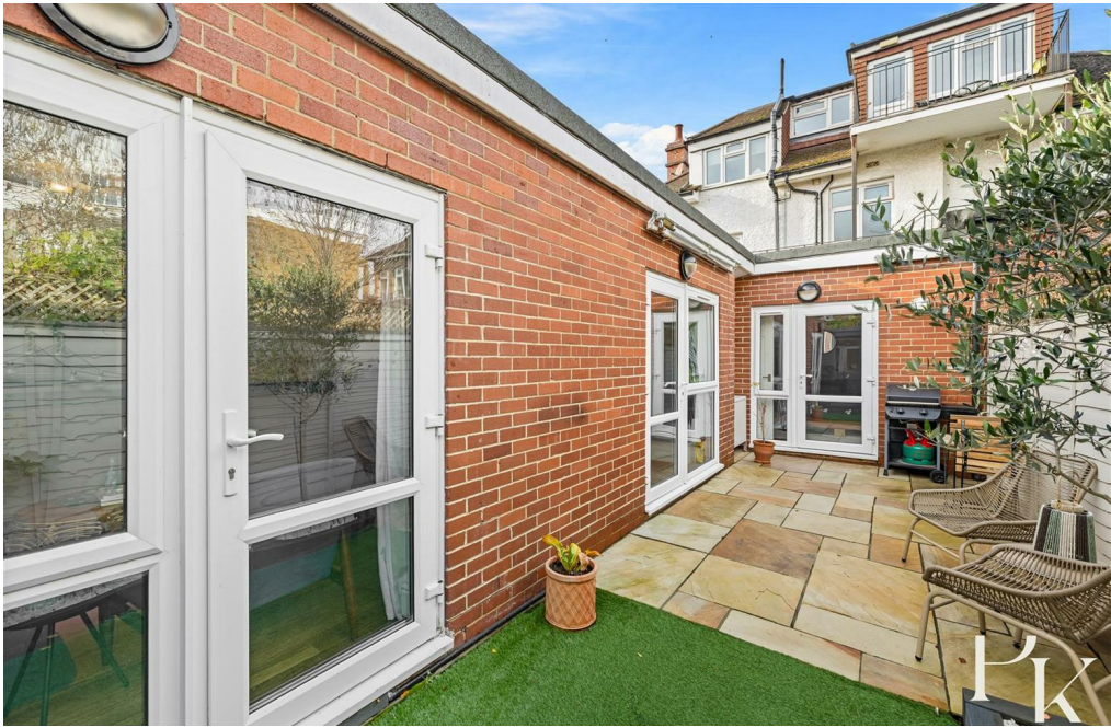
Somerhill Road, Hove Approximately 64 sqm (689.8 sqft)