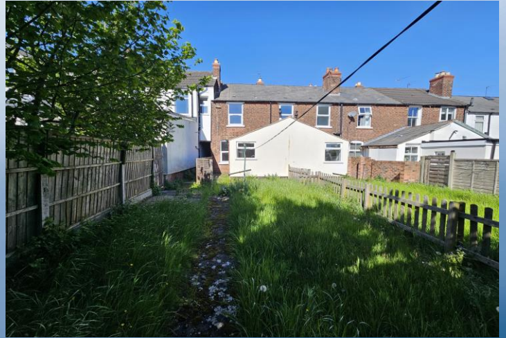
45 & 47 Goldthorn Road, Wolverhampton WV2 4PY