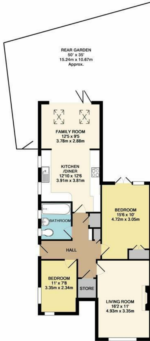
GROUND FLOOR MAISONETTE

LINDEN CLOSE, THAMES DITTON INTERNAL FLOOR AREA (APPROX.) 850 sq ft/ 78.97 sq m