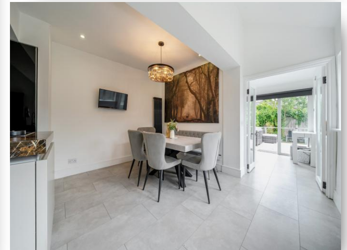
164 Blackamoor Lane, Maidenhead SL6 8RT