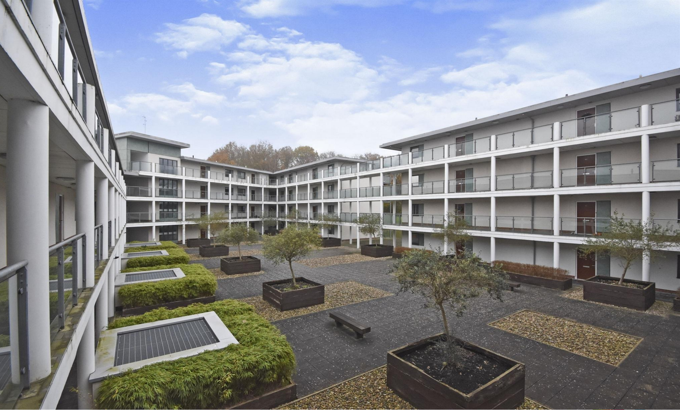
Brooking House, Rollason Way, Brentwood, CM14 4ET