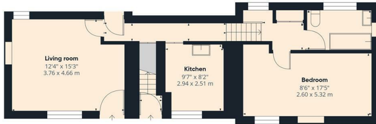
Ground Floor - Flat 14