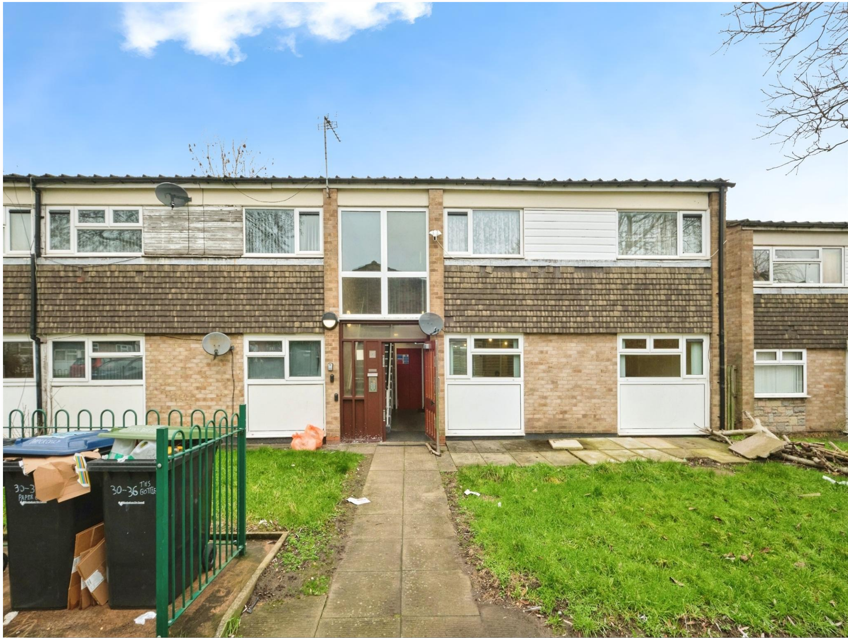
Bromwich Walk, Birmingham B9 5PE