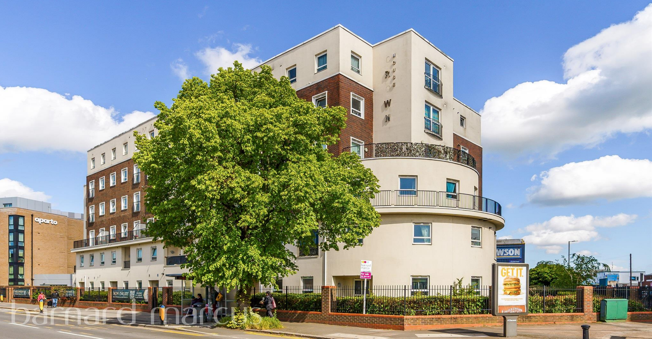
Crown House Kingston Road, New Malden KT3 3NA