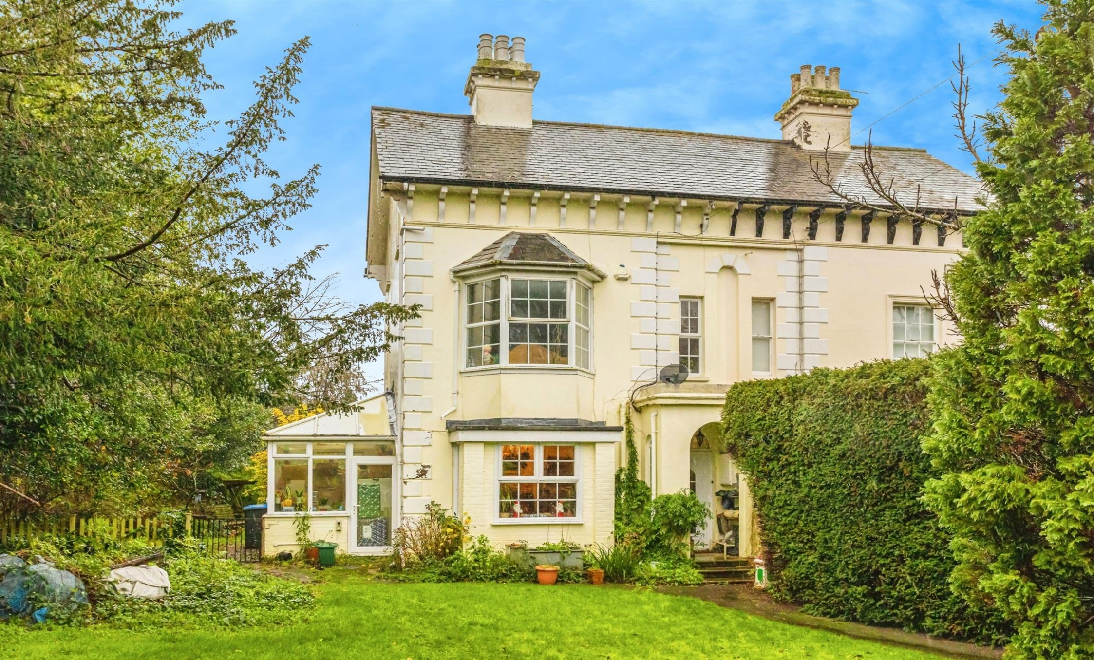
London Road, Burgess Hill RH15 8NE