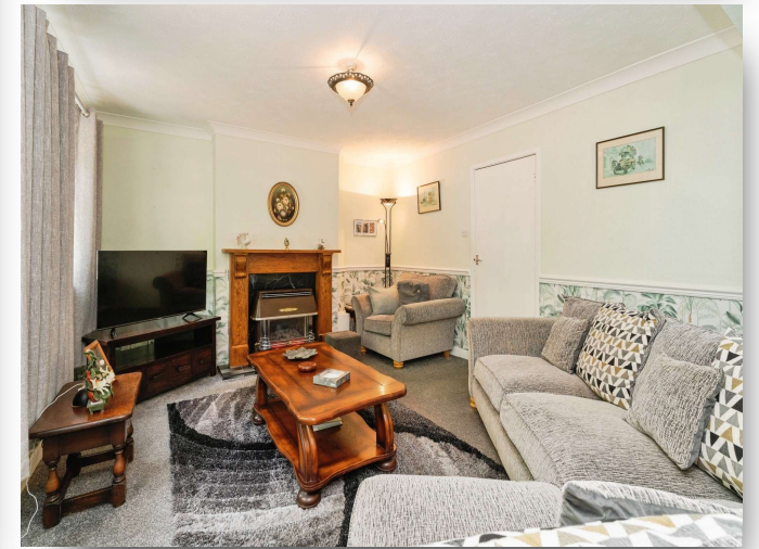
Station Road, Great Ryburgh, Fakenham NR21 0AE