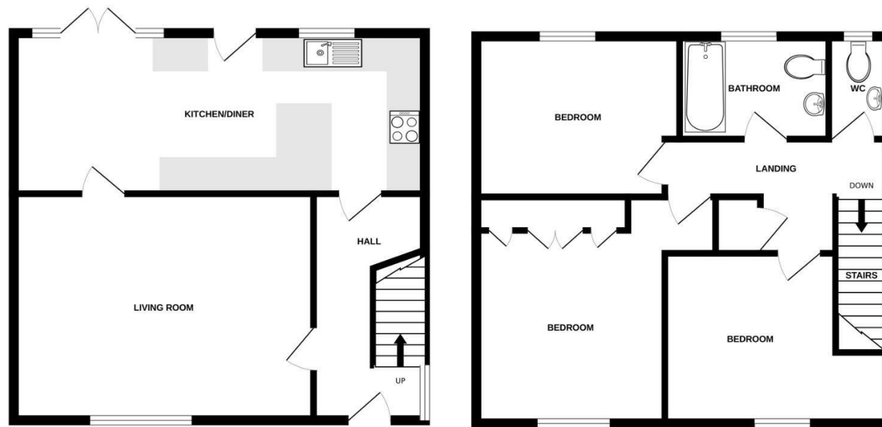
TOTAL FLOOR AREA : 1115 sq.ft. (103.6 sq.m.) approx. Made with Metropix ©2026